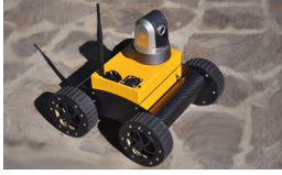
Fig.1 Black Cat

Robotics is the engineering science and technology of robots, and their design, manufacture, application, and structural disposition. The mechanical structure of a robot must be controlled to perform tasks.